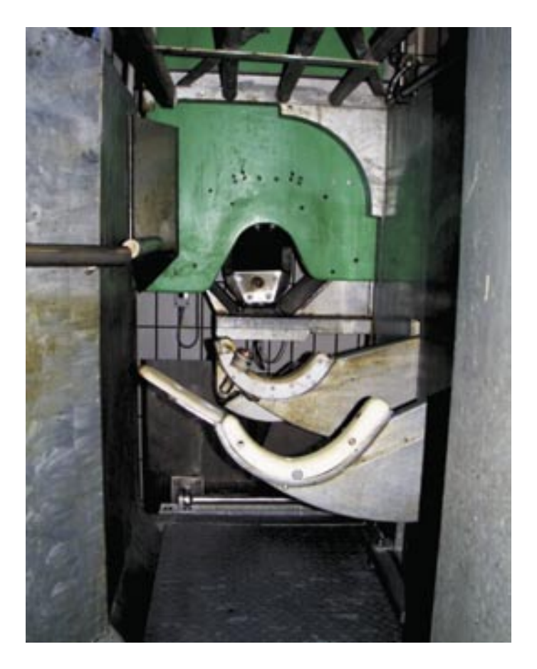
Fig. 3. Internal view of the stunning box (in animal direction): Breast and abdomen support bars (with cardio-electrode) and head fixing slide (green) in stunning position; muzzle electrode (centre back)

inducing ventricular fibrillation (Fig. 3). At the end of the stunning current flow the box is rotated by approx. 20° at the side and the sticking takes place in the box, where the cattle still remains in an upright position. The sticking can be accomplished within 10 seconds of the end of the current flow. After the torrent of blood has ended the box is turned to the side, either by 90° to fasten the looped chains and pull the animal out upwards, or by 120° to allow the cattle to slide onto a receiving grate or a conveyor belt. Through a stunning